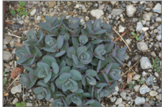
Rock 'N Grow Superstar Stonecrop