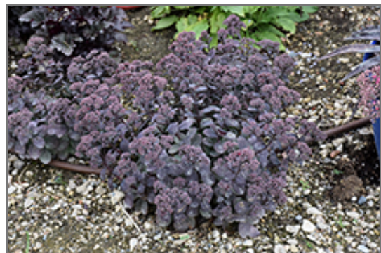
Rock 'N Grow Superstar Stonecrop in bloom