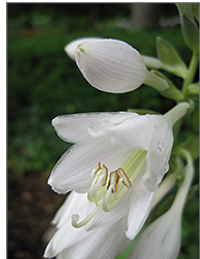
Frances Williams Hosta flowers