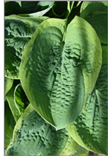
Frances Williams Hosta foliage

This plant does best in partial shade to shade. It prefers to grow in average to moist conditions, and shouldn't be allowed to dry out. It is not particular as to soil type or pH. It is somewhat tolerant of urban pollution. This particular variety is an interspecific hybrid. It can be propagated by division; however, as a cultivated variety, be aware that it may be subject to certain restrictions or prohibitions on propagation.