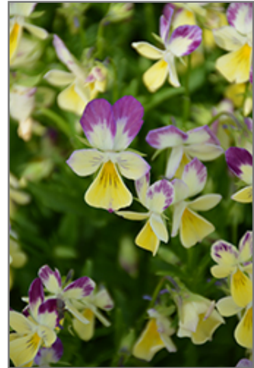
Hip Hop Honeybunny Pansy flowers