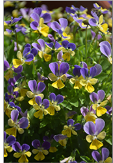
Hip Hop Bluebunny Pansy flowers