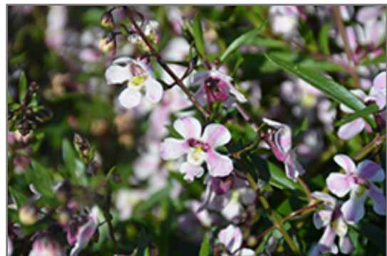
Pinstripe Vintage Pink Angelonia flowers