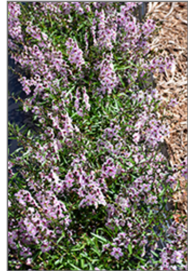
Pinstripe Vintage Pink Angelonia in bloom

Pinstripe Vintage Pink Angelonia is a fine choice for the garden, but it is also a good selection for planting in outdoor containers and hanging baskets. It is often used as a 'filler' in the 'spiller-thriller-filler' container combination, providing a mass of flowers against which the larger thriller plants stand out. Note that when growing plants in outdoor containers and baskets, they may require more frequent waterings than they would in the yard or garden.