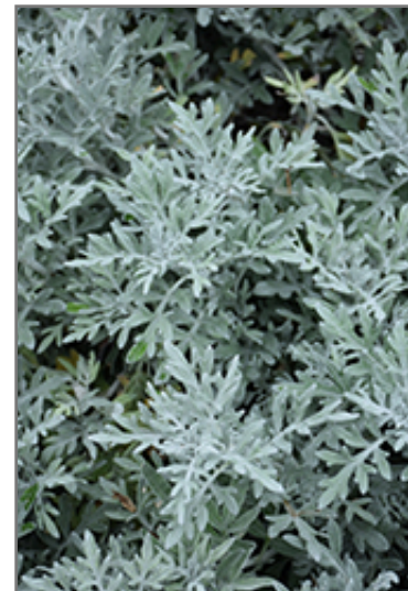
Silver Bullet Dusty Miller foliage