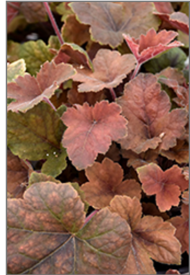
Pumpkin Spice Foamy Bells foliage

Pumpkin Spice Foamy Bells is recommended for the following landscape applications;