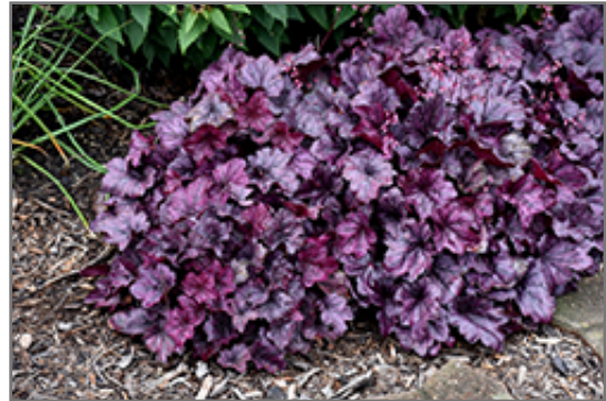
Wild Rose Coral Bells

This is a relatively low maintenance plant, and should be cut back in late fall in preparation for winter. It is a good choice for attracting hummingbirds to your yard. It has no significant negative characteristics.