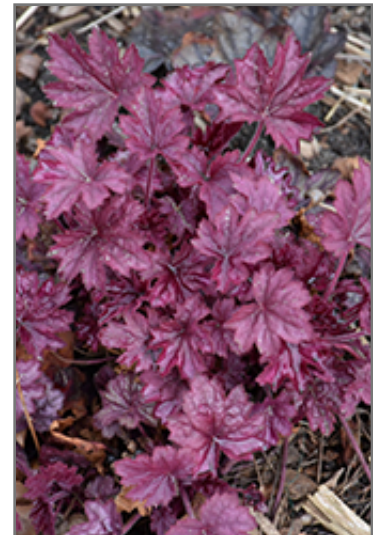
Wild Rose Coral Bells foliage