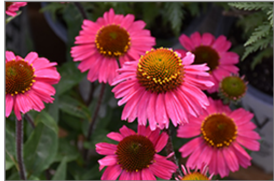
Sensation Pink Coneflower flowers

Sensation Pink Coneflower is recommended for the following landscape applications;