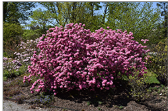
Weston's Aglo Rhododendron in bloom