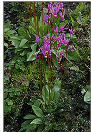
Shooting Star in bloom