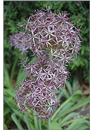
Star Of Persia Onion flowers