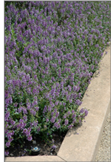
Serenita Sky Blue Angelonia in bloom

Serenita Sky Blue Angelonia is a fine choice for the garden, but it is also a good selection for planting in outdoor containers and hanging baskets. It is often used as a 'filler' in the 'spiller-thriller-filler' container combination, providing a mass of flowers against which the larger thriller plants stand out. Note that when growing plants in outdoor containers and baskets, they may require more frequent waterings than they would in the yard or garden.