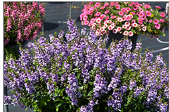
Serenita Sky Blue Angelonia in bloom