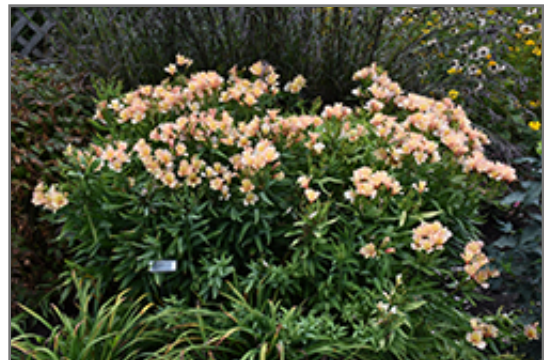
Inca Ice Alstroemeria in bloom