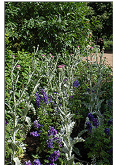
Scotch Thistle in bloom