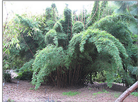
Chocolate Bamboo