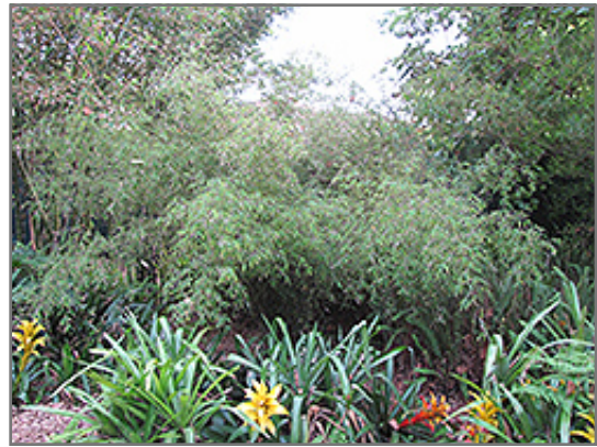
Narrow-Leaved Clumping Bamboo

Narrow-Leaved Clumping Bamboo is a fine choice for the garden, but it is also a good selection for planting in outdoor pots and containers. Because of its height, it is often used as a 'thriller' in the 'spiller-thriller-filler' container combination; plant it near the center of the pot, surrounded by smaller plants and those that spill over the edges. It is even sizeable enough that it can be grown alone in a suitable container. Note that when growing plants in outdoor containers and baskets, they may require more frequent waterings than they would in the yard or garden.