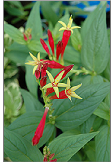
Indian Pink flowers

Indian Pink is recommended for the following landscape applications;