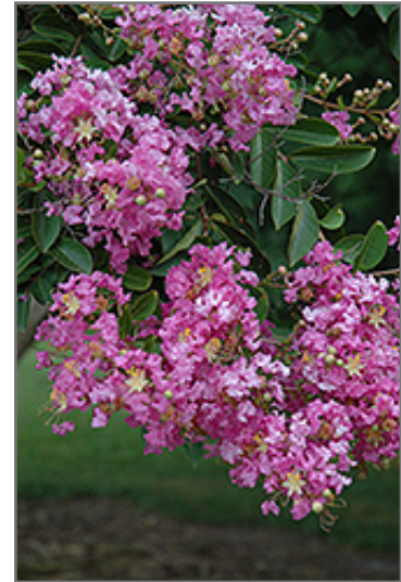
Lipan Crapemyrtle flowers