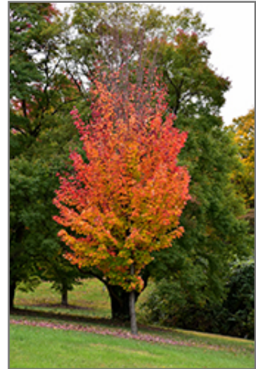
Red Rocket Red Maple in fall

This is a relatively low maintenance tree, and should only be pruned in summer after the leaves have fully developed, as it may 'bleed' sap if pruned in late winter or early spring. It has no significant negative characteristics.