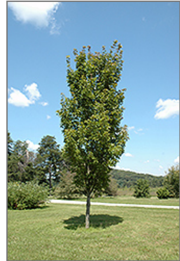
Red Rocket Red Maple

This tree should only be grown in full sunlight. It is quite adaptable, preferring to grow in average to wet conditions, and will even tolerate some standing water. It is not particular as to soil type, but has a definite preference for acidic soils, and is subject to chlorosis (yellowing) of the foliage in alkaline soils. It is somewhat tolerant of urban pollution. This is a selection of a native North American species.