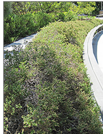
Pigeon Point Coyote Brush