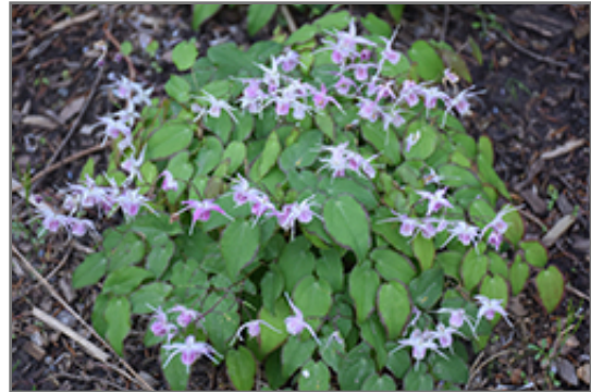
Queen Esta Bishop's Hat in bloom