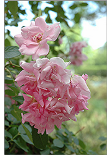
Climbing Pinkie Rose flowers

Climbing Pinkie Rose is recommended for the following landscape applications;