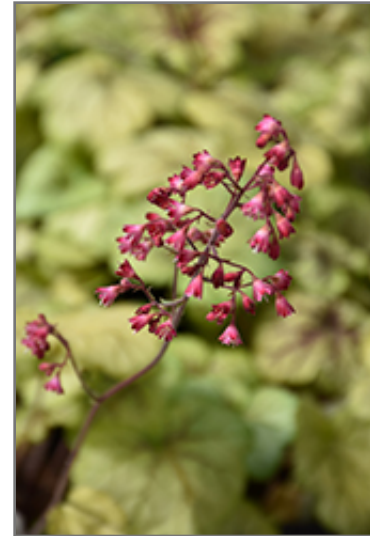
Circus Coral Bells flowers

Circus Coral Bells is a fine choice for the garden, but it is also a good selection for planting in outdoor pots and containers. With its upright habit of growth, it is best suited for use as a 'thriller' in the 'spiller-thriller-filler' container combination; plant it near the center of the pot, surrounded by smaller plants and those that spill over the edges. Note that when growing plants in outdoor containers and baskets, they may require more frequent waterings than they would in the yard or garden.