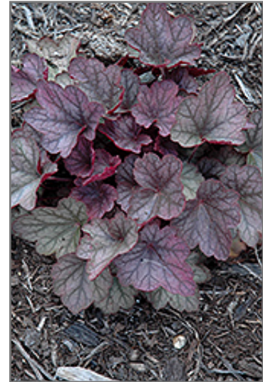
Carnival Rose Granita Coral Bells foliage

Carnival Rose Granita Coral Bells is recommended for the following landscape applications;