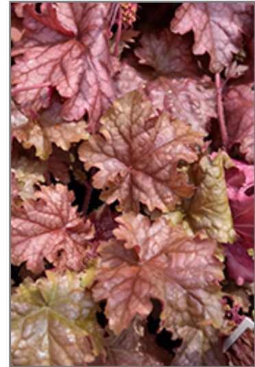
Carnival Peach Parfait Coral Bells foliage

Carnival Peach Parfait Coral Bells is recommended for the following landscape applications;