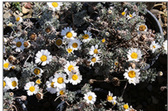
Moroccan Daisy flowers