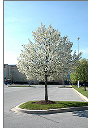
Jack Ornamental Pear in bloom