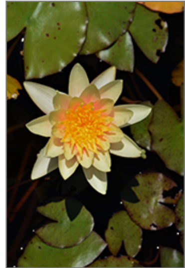
Comanche Hardy Water Lily flowers

Comanche Hardy Water Lily is ideally suited for growing in a pond, water garden or patio water container, and is recommended for the following landscape applications;