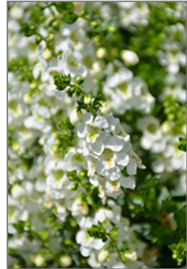
Serenita White Angelonia flowers

Serenita White Angelonia is an herbaceous annual with an upright spreading habit of growth. Its relatively fine texture sets it apart from other garden plants with less refined foliage.