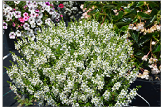
Serenita White Angelonia flowers