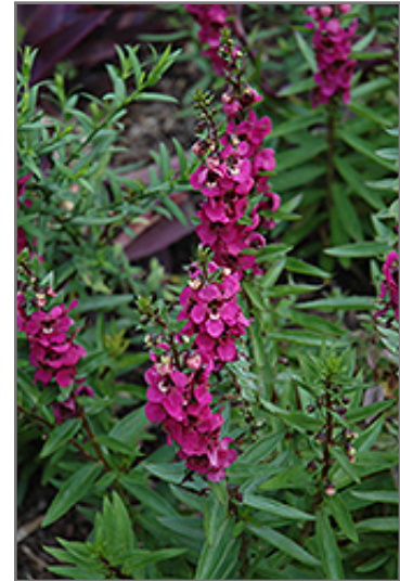
Serenita Raspberry Angelonia flowers

This plant will require occasional maintenance and upkeep, and should not require much pruning, except when necessary, such as to remove dieback. It is a good choice for attracting butterflies to your yard, but is not particularly attractive to deer who tend to leave it alone in favor of tastier treats. It has no significant negative characteristics.