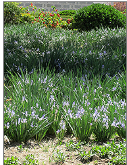
Pallas Chinese Iris in bloom