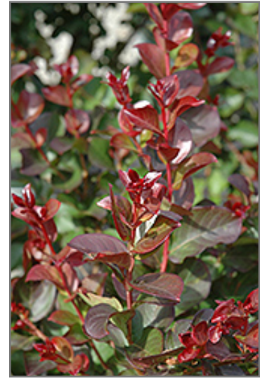
Dynamite Crapemyrtle foliage

This tree does best in full sun to partial shade. It prefers to grow in average to moist conditions, and shouldn't be allowed to dry out. It is very fussy about its soil conditions and must have rich, acidic soils to ensure success, and is subject to chlorosis (yellowing) of the foliage in alkaline soils. It is highly tolerant of urban pollution and will even thrive in inner city environments. This is a selected variety of a species not originally from North America.