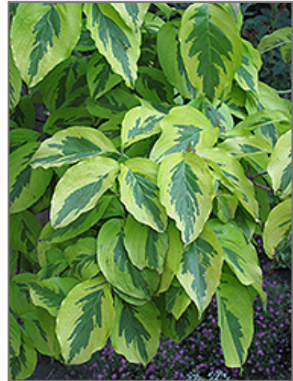
Cherokee Sunset Flowering Dogwood foliage

Cherokee Sunset Flowering Dogwood is recommended for the following landscape applications;