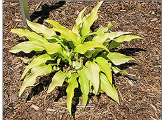
Hadspen Sapphire Hosta