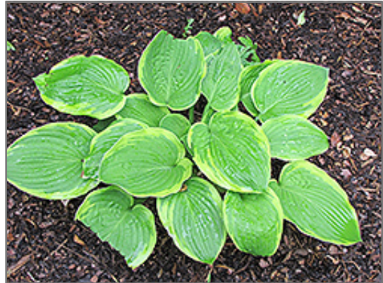
Abiqua Moonbeam Hosta