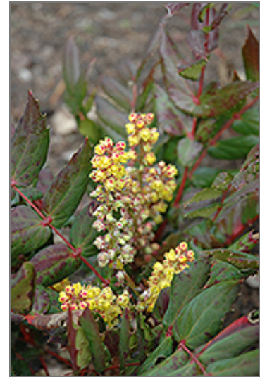
Oregon Grape Holly flowers

Oregon Grape Holly is a multi-stemmed evergreen shrub with a ground-hugging habit of growth. Its average texture blends into the landscape, but can be balanced by one or two finer or coarser trees or shrubs for an effective composition.