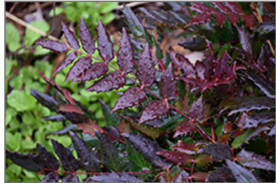
Oregon Grape Holly foliage

This shrub does best in partial shade to shade. It does best in average to evenly moist conditions, but will not tolerate standing water. It is not particular as to soil pH, but grows best in rich soils. It is somewhat tolerant of urban pollution, and will benefit from being planted in a relatively sheltered location. Consider applying a thick mulch around the root zone in winter to protect it in exposed locations or colder microclimates. This species is native to parts of North America.