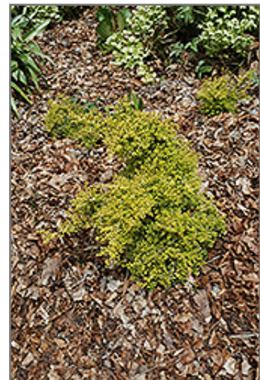
Baggesen's Gold Box Honeysuckle