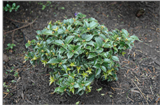
Rock Garden Holly