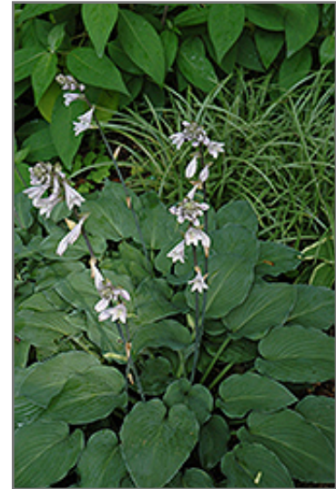
Valentine Lace Hosta flowers