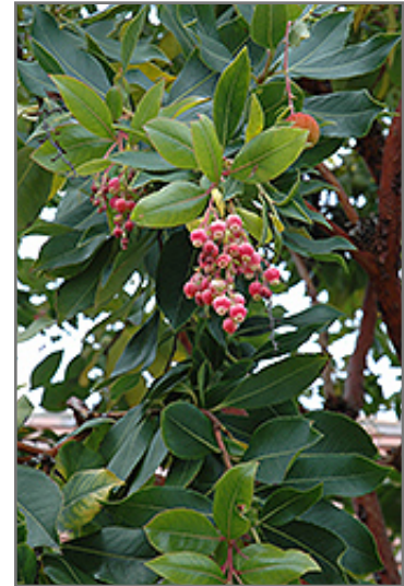
Pacific Madrone flowers

This tree should only be grown in full sunlight. It is very adaptable to both dry and moist growing conditions, but will not tolerate any standing water. It is considered to be drought-tolerant, and thus makes an ideal choice for xeriscaping or the moisture-conserving landscape. It is not particular as to soil type or pH. It is somewhat tolerant of urban pollution. This species is native to parts of North America.