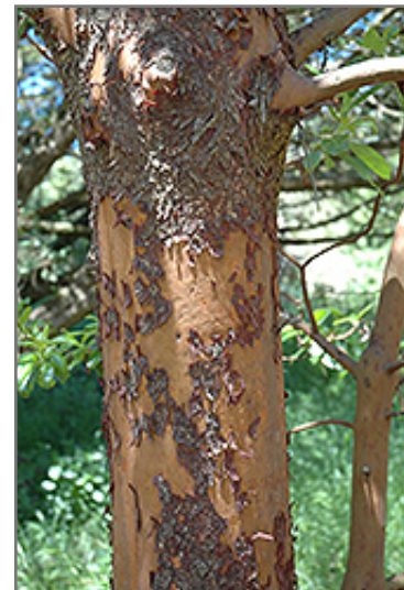
Pacific Madrone bark