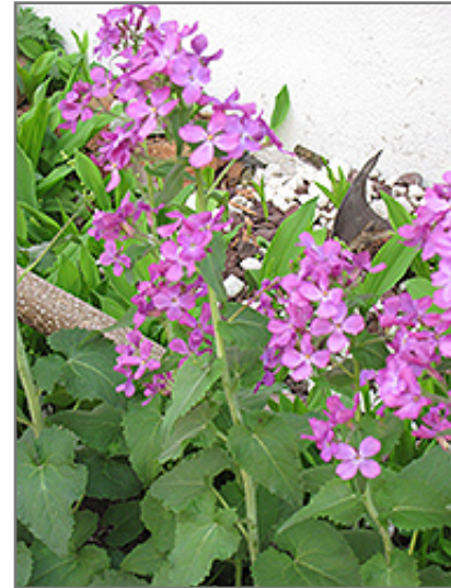
Biennial Money Plant flowers