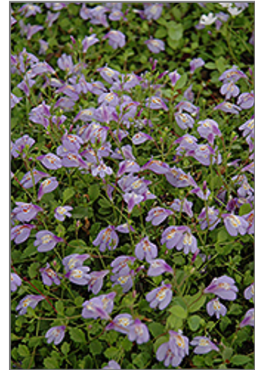
Creeping Mazus flowers