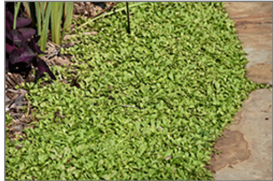
Creeping Mazus

Creeping Mazus is a fine choice for the garden, but it is also a good selection for planting in outdoor pots and containers. Because of its spreading habit of growth, it is ideally suited for use as a 'spiller' in the 'spiller-thriller-filler' container combination; plant it near the edges where it can spill gracefully over the pot. Note that when growing plants in outdoor containers and baskets, they may require more frequent waterings than they would in the yard or garden.