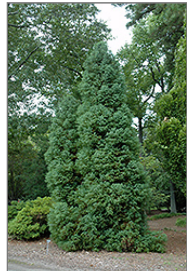
Elegans Japanese Cedar