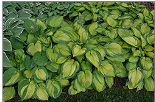
Paradigm Hosta