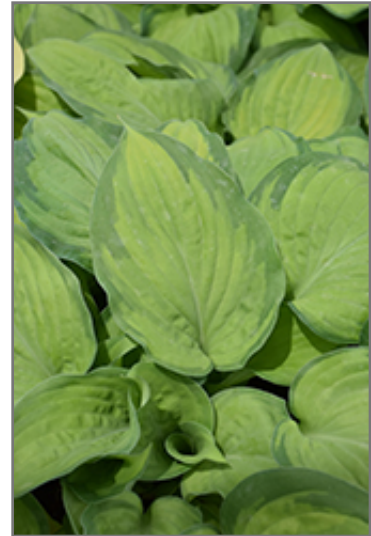
Paradigm Hosta foliage

This plant does best in partial shade to shade. It prefers to grow in average to moist conditions, and shouldn't be allowed to dry out. It is not particular as to soil type or pH. It is somewhat tolerant of urban pollution. This particular variety is an interspecific hybrid. It can be propagated by division; however, as a cultivated variety, be aware that it may be subject to certain restrictions or prohibitions on propagation.