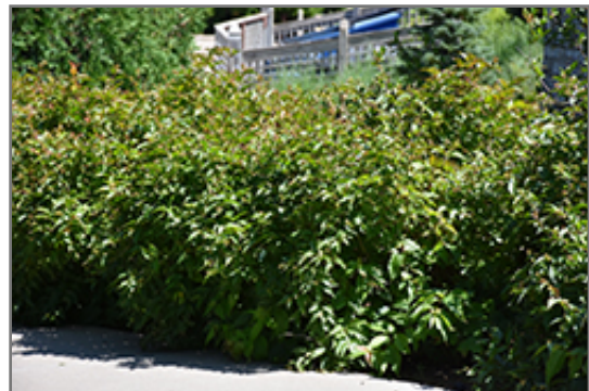
Copper Bush Honeysuckle