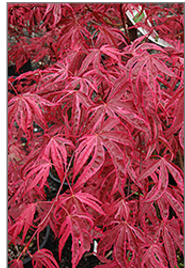
Shirazz Japanese Maple foliage