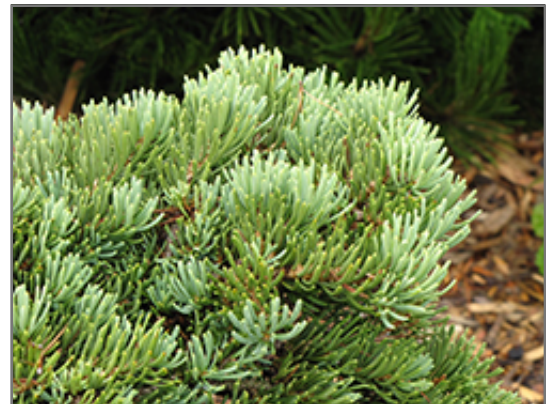
Masonic Broom White Fir foliage