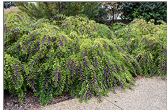
Issai Beautyberry fruit