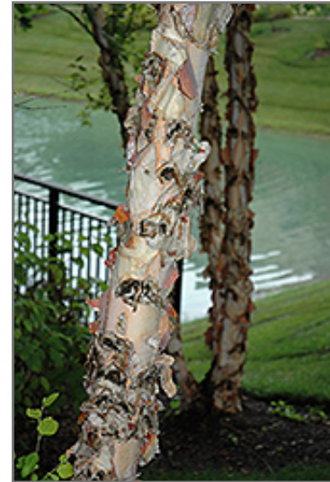
River Birch bark